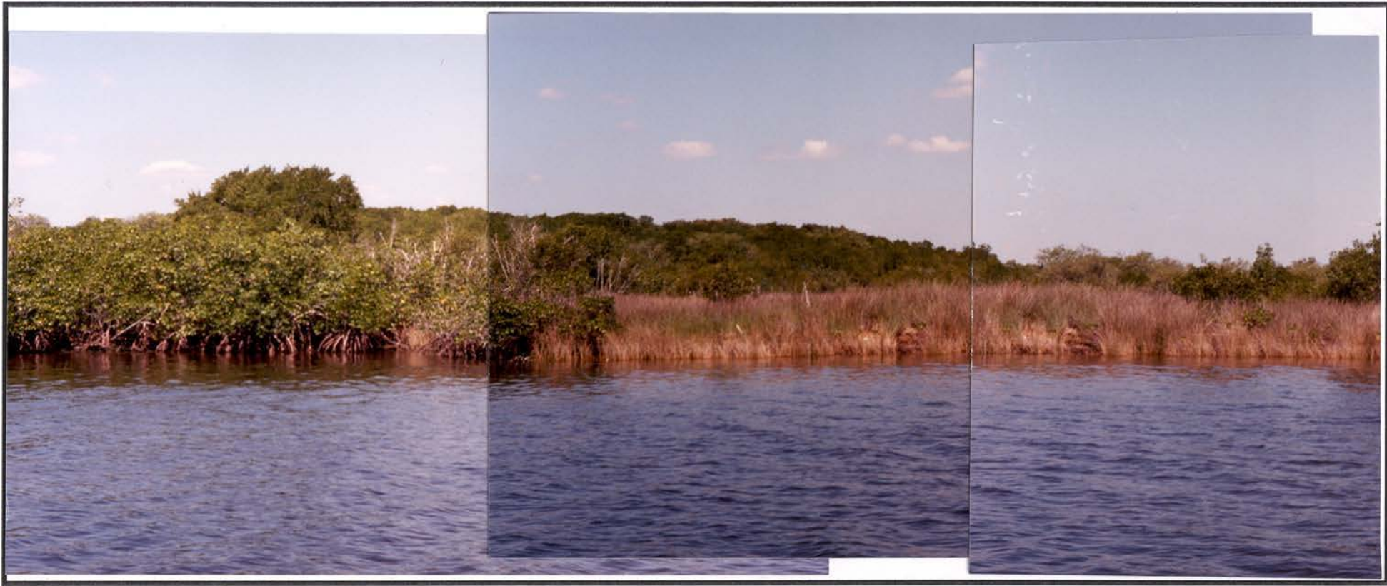
Photo 1, needlerush ( Juncus roemarianus ), 12.2 kilometers, west bank, first occurrence - 2000.