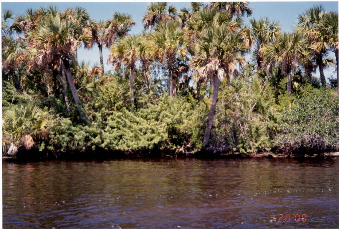
Photo 19, Brazilian pepper ( Schinus terebinthifolius ), 23.3 kilometers, east bank, last occurrence - 2000.