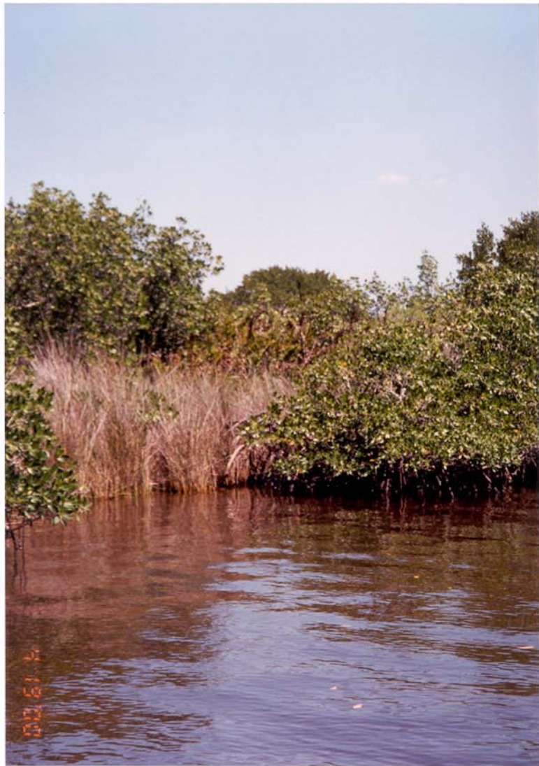
Photo 2, leather fern ( Acrostichum danaeifolium ), 12.2 kilometers, west bank island, first occurrence - 2000.