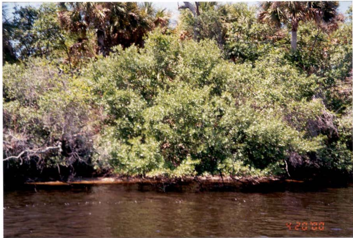
Photo 18, laurel oak ( Quercus laurifolia ), 22.9 kilometers, east bank, first occurrence - 2000.