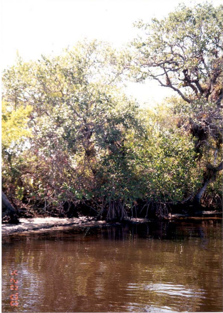
Photo 14, red mangrove ( Rhizophora mangle ), 21.6 kilometers, last occurrence - 2000.