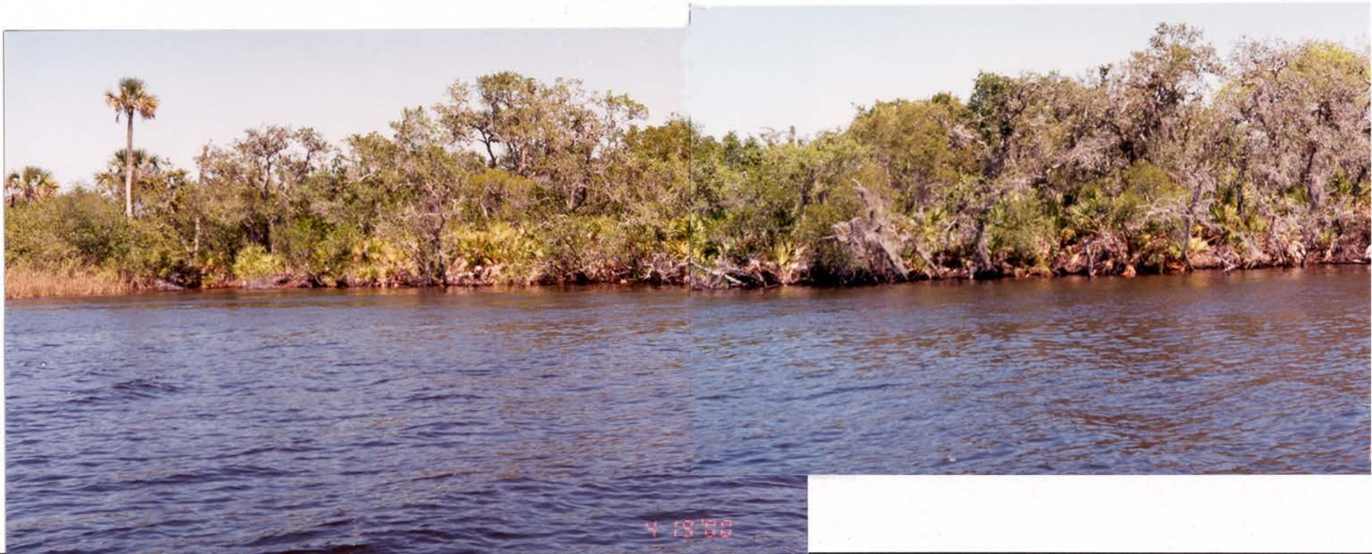
Photo 8, live oak/ saw palmetto ( Quercus virginiana/Serenoa repens ) 18.5 kilometers, east bank, first occurrence - 2000.