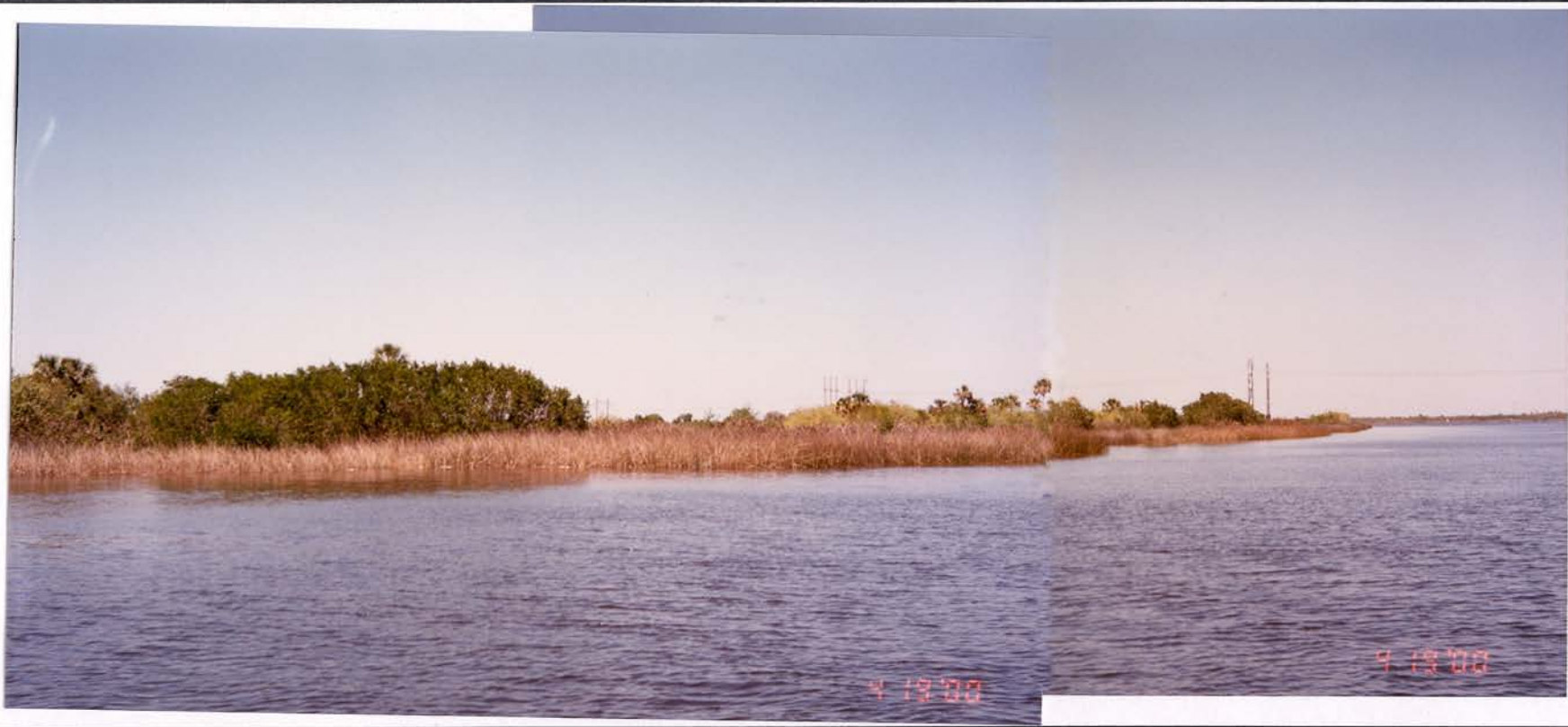
Photo 5, cabbage palm, ( Sabal palmetto ), 16.8 kilometers, west bank, first occurrence - 2000.