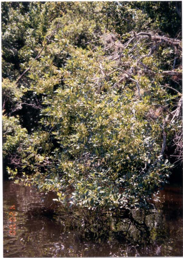
Photo 26, popash, ( Fraxinus caroliniana ), 25.8 kilometers, west bank, first occurrence - 2000.