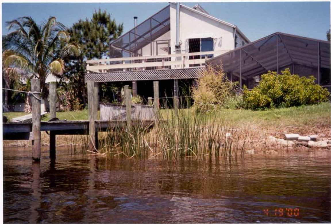
Photo 3a, softstem bulrush, ( Scirpus validus ), first occurrence, downstream migration to 13.1 kilometers - 2000.