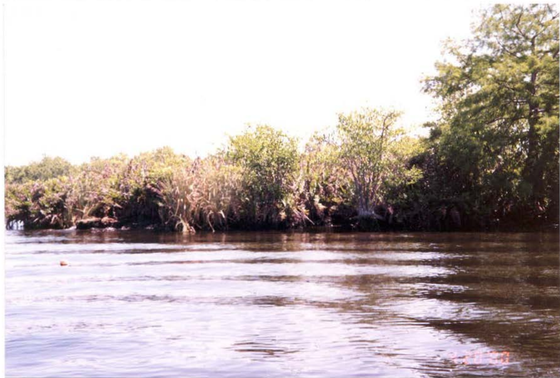
Photo 21, pond apple ( Annona glabra ), last occurrence at 23.3 kilometers - 2000.