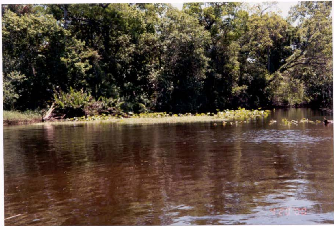
Photo 24, leather fern ( Acrostichum danaeifolium ), 29.4 kilometers, west bank, last occurrence - 2000.