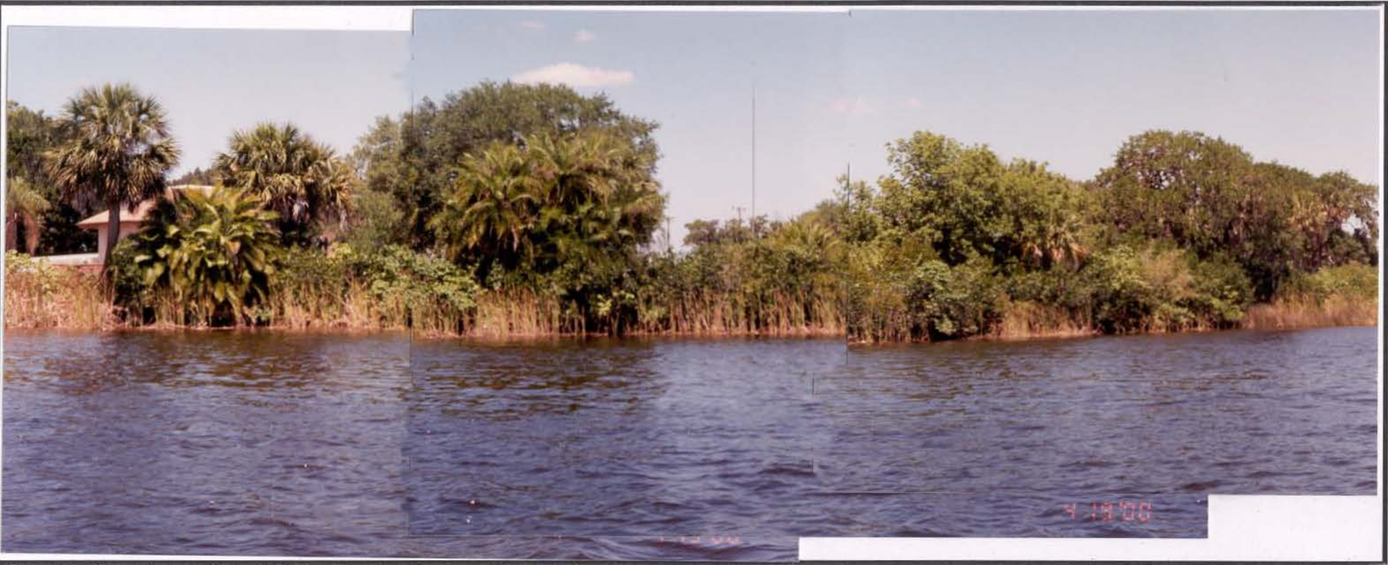
Photo 4, softstem bulrush/cattail ( Scirpus validus / Typha spp. ), 15.1 kilometers, west bank - 2000.