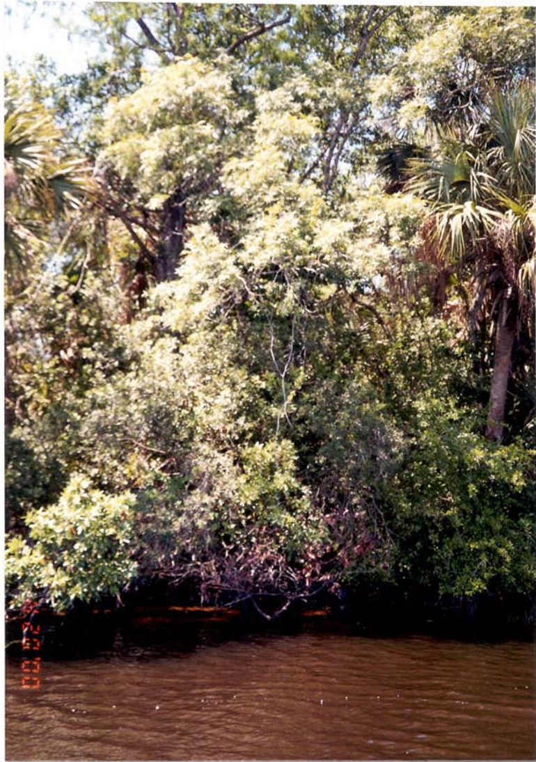
Photo 23, American elm, ( Ulmus americana ), first occurrence at 25.3 kilometers, photograph at 26.2 kilometers, west bank - 2000.