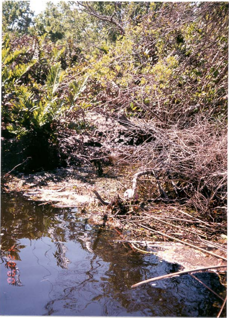
Photo 13, taro ( Colocasia esculenta ), 24.4 kilometers, east bank, first occurrence - 2000.