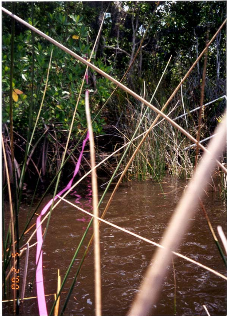
Photo 2, transition site I, line transect - 2000.