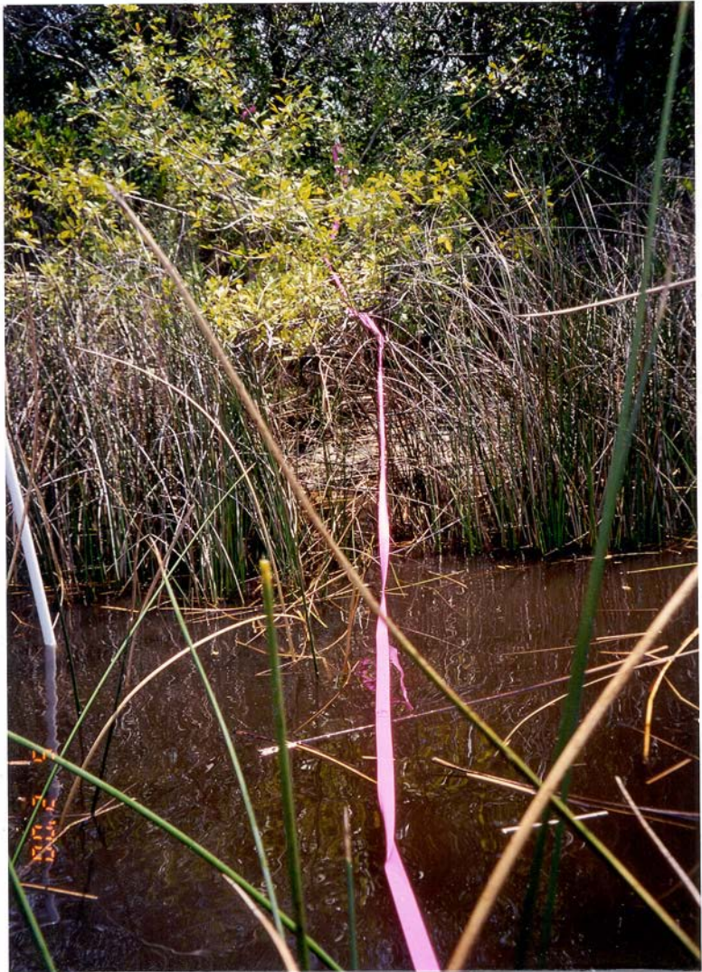
Photo 9, transition site III, downstream belt transects midline - 2000.