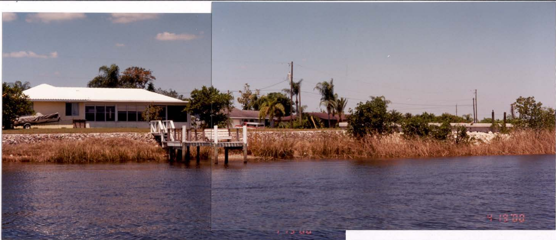
Photo 3, softstem bulrush, ( Scirpus validus ), first occurrence 1998, 14.4 kilometers, west bank - 2000.