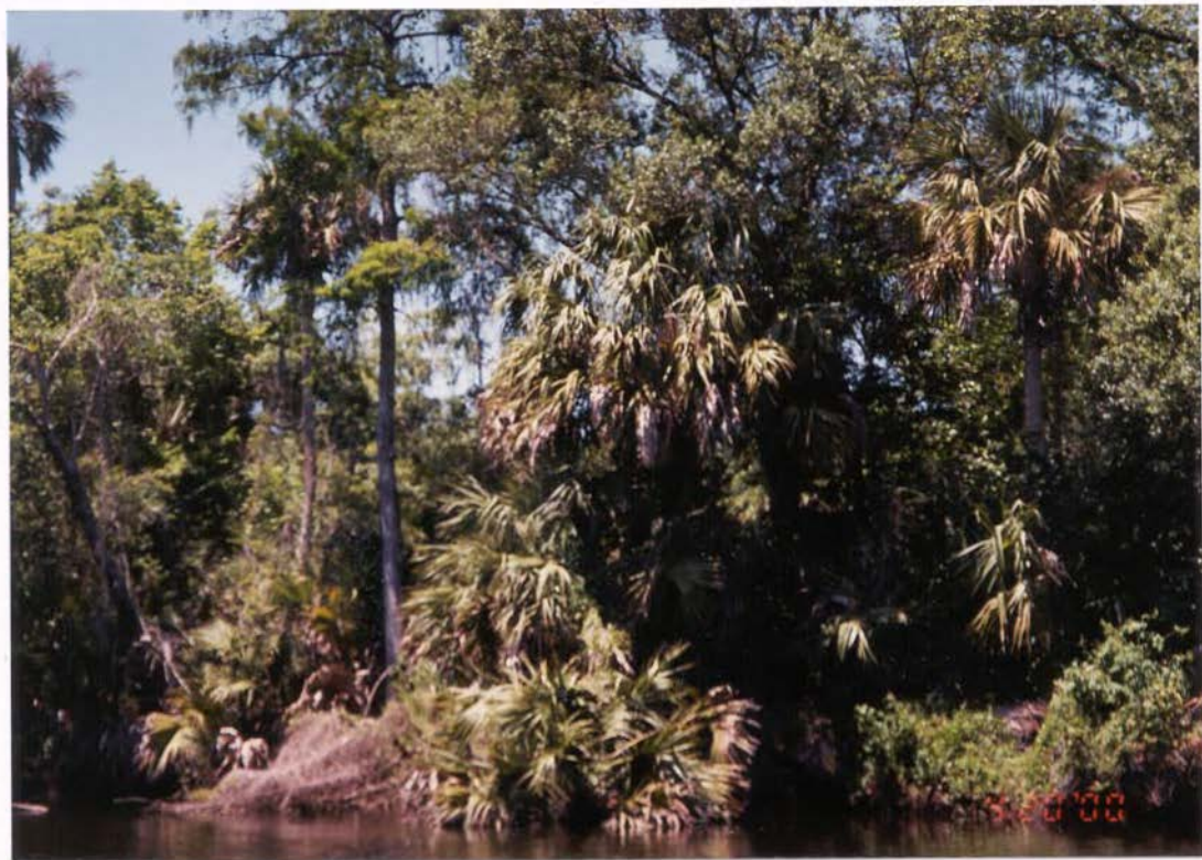
Photo 28, cabbage palm ( Sabal palmetto ), 30.4 kilometers, west bank, - 2000.