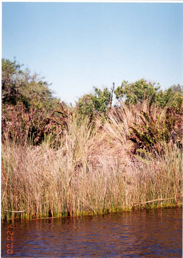
Photo 10, sand cordgrass ( Spartina bakeri ), 20.2 kilometers, west bank, last occurrence - 2000.