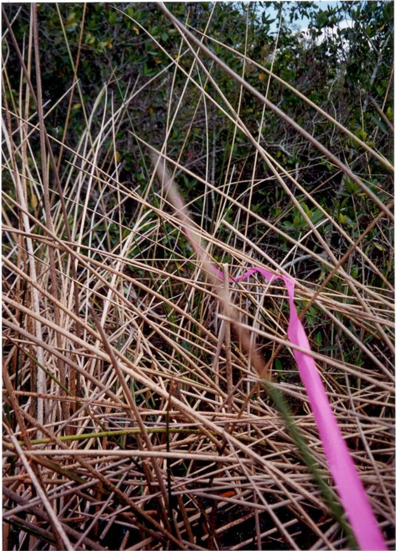
Photo 8, transition site III, line transect - 2000.