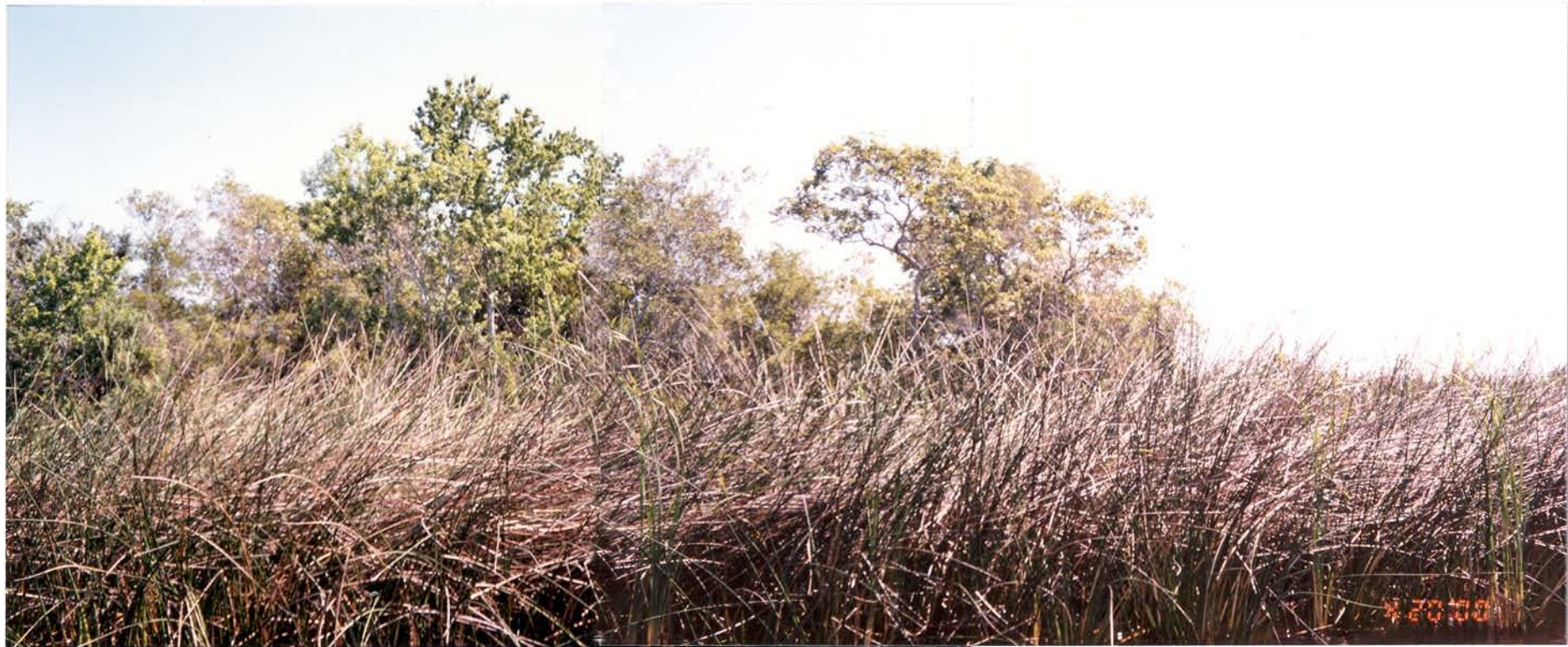
Photo 17, red maple ( Acer rubrum ), 22.2 kilometers, east bank, first occurrence - 2000.