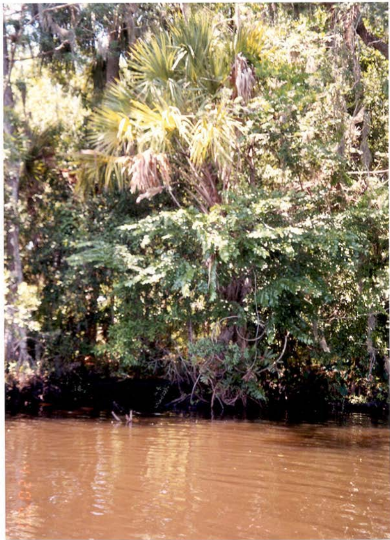
Photo 29, water hickory ( Carya aquatica ), 24.2 kilometers, west bank, first occurrence - 2000.