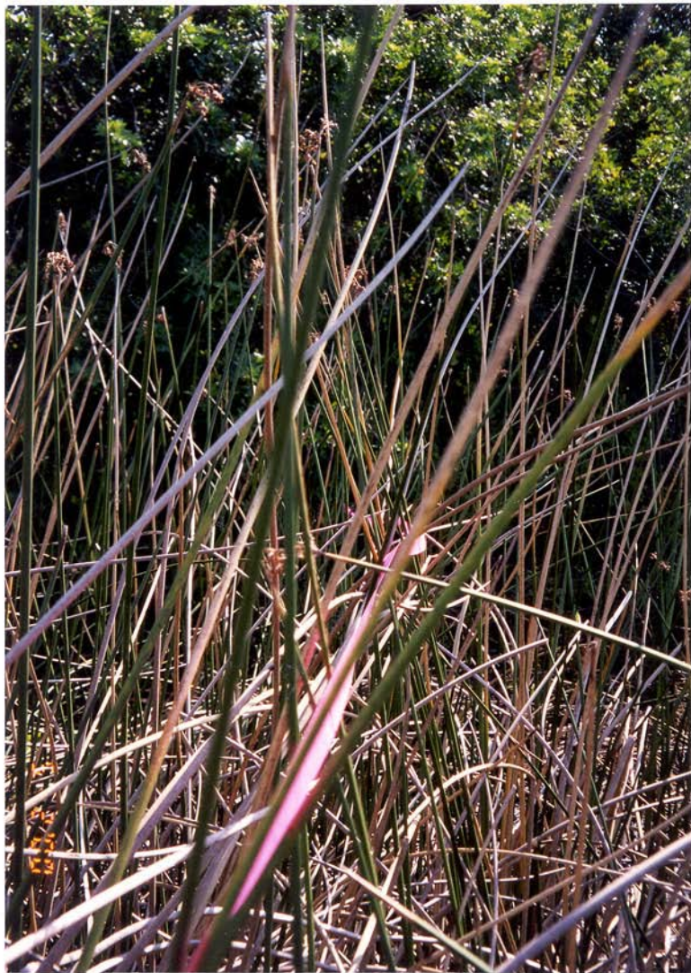
Photo 7, transition site III, upstream belt transects midline - 2000.