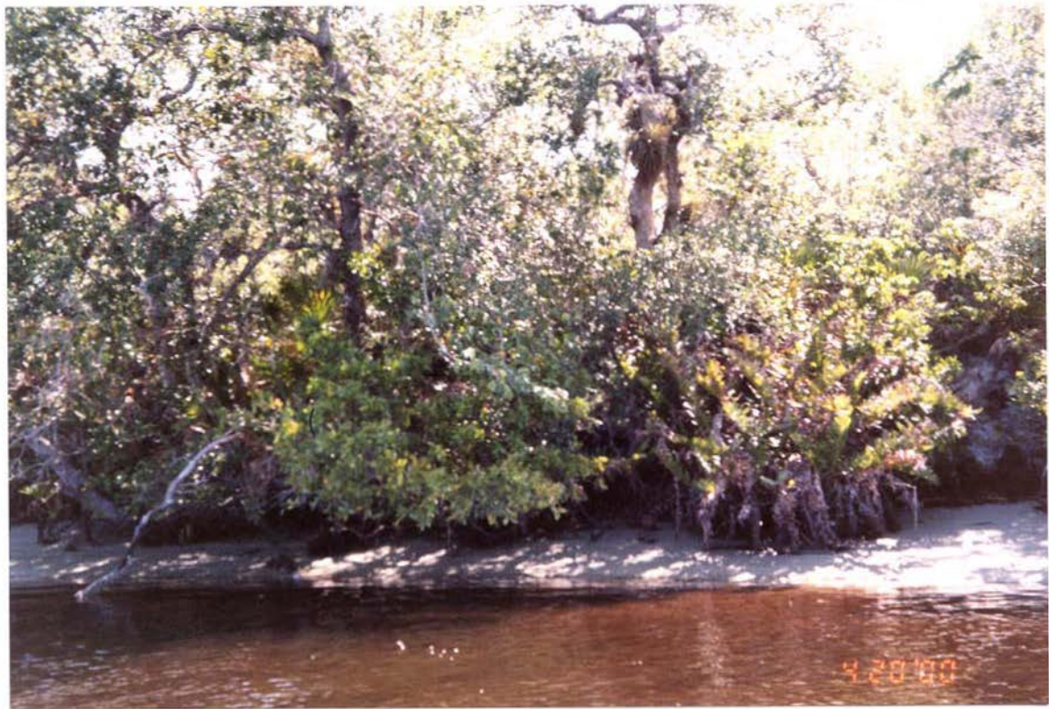
Photo 15, white mangrove ( Laguncularia racemosa ), 21.3 kilometers, east bank, last occurrence - 2000.