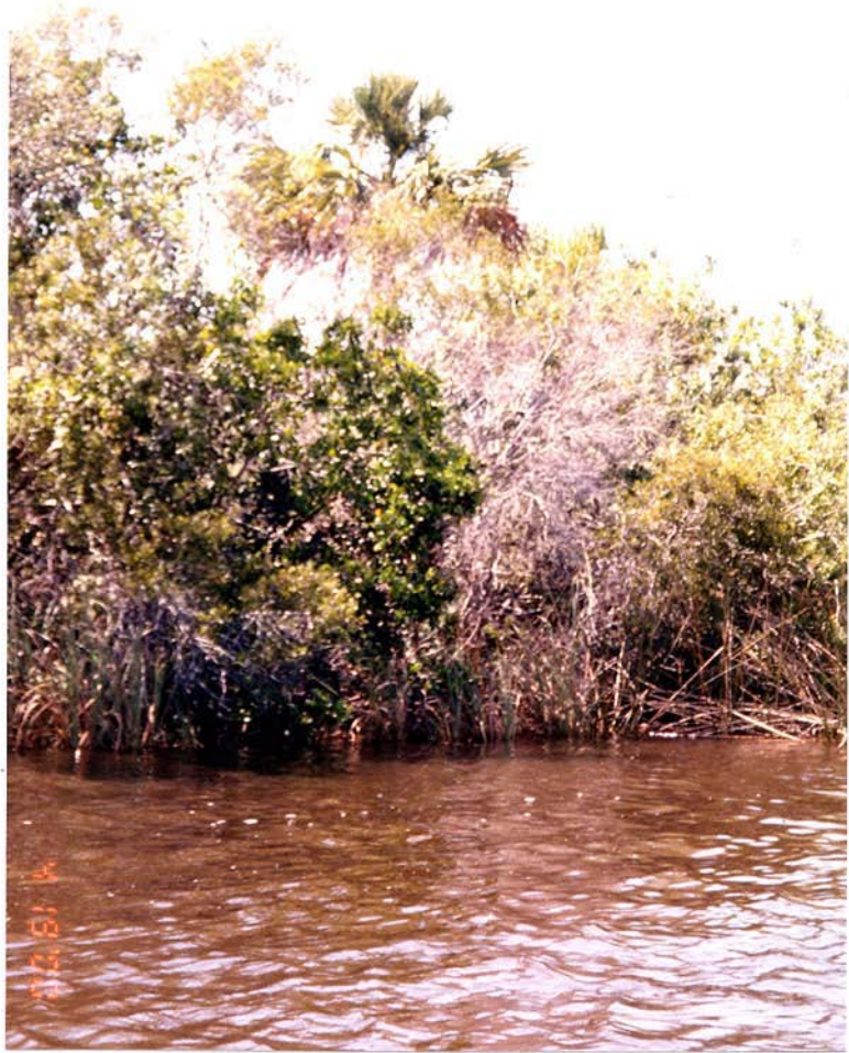
Photo 9, wax myrtle ( Myrica cerifera ), 19 kilometers, west bank, first occurrence - 2000.