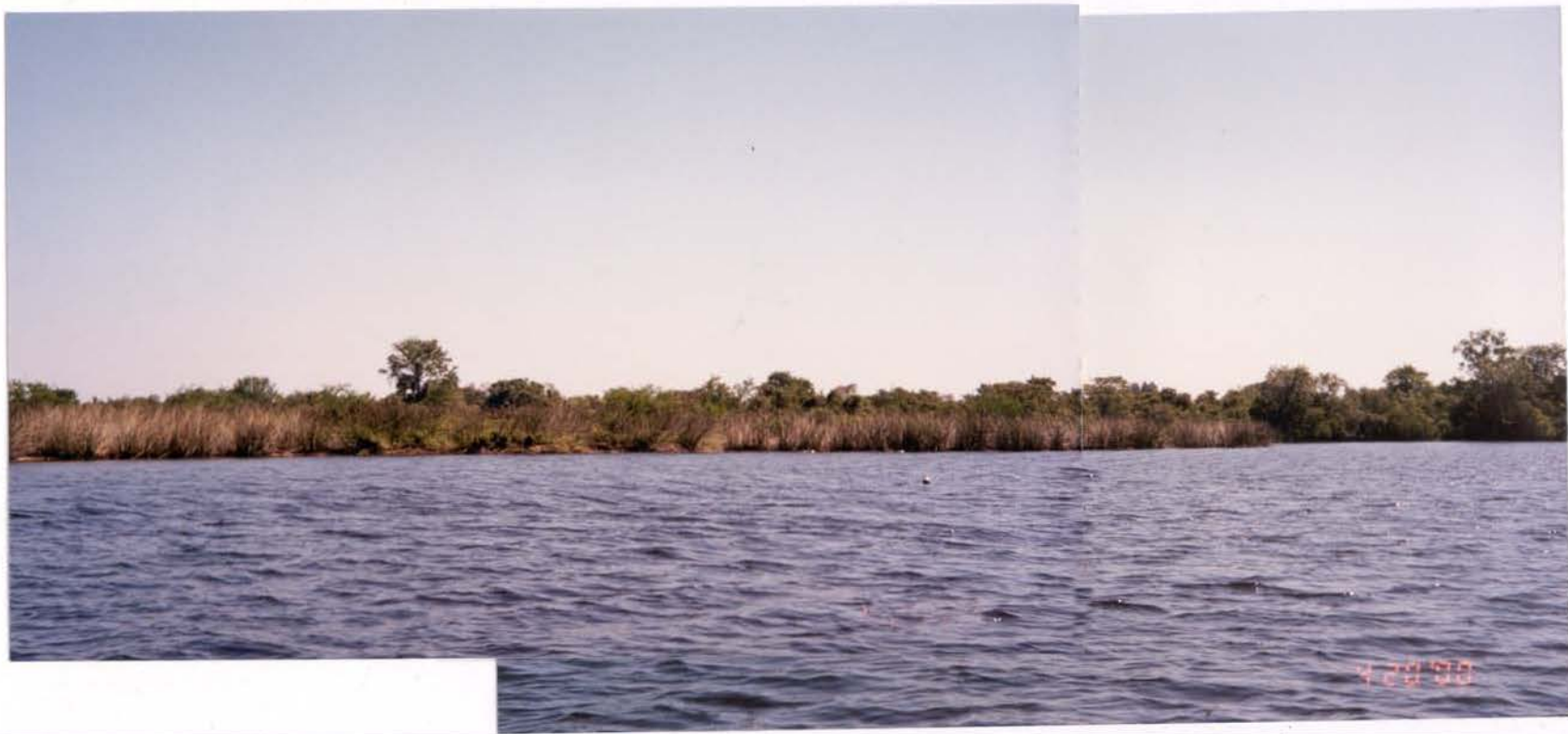
Photo 12, cypress ( Taxidum distichum ), 22.1 kilometers, east bank, first occurrence - 2000.