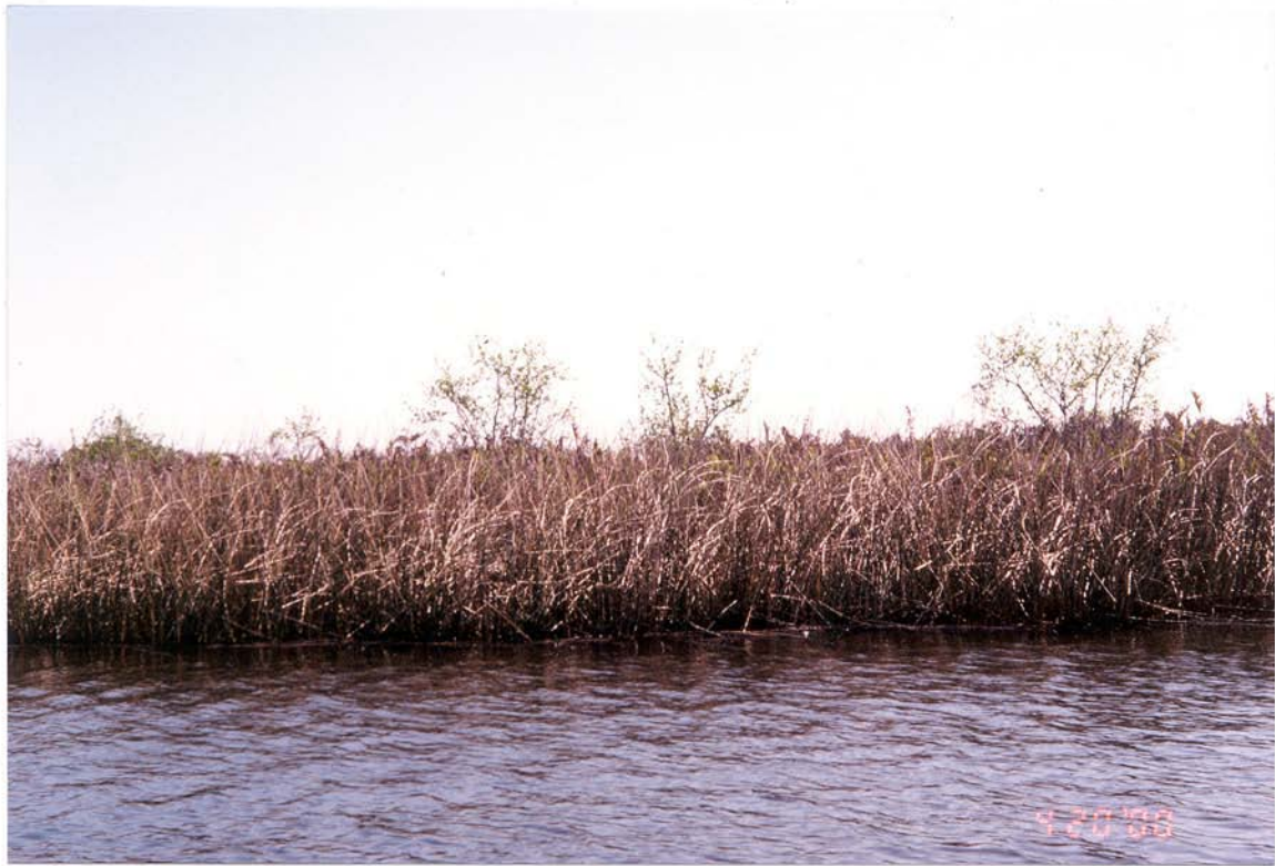
Photo 11, pond apple ( Annona glabra ), 18.5 kilometers, east bank, first occurrence - 2000.