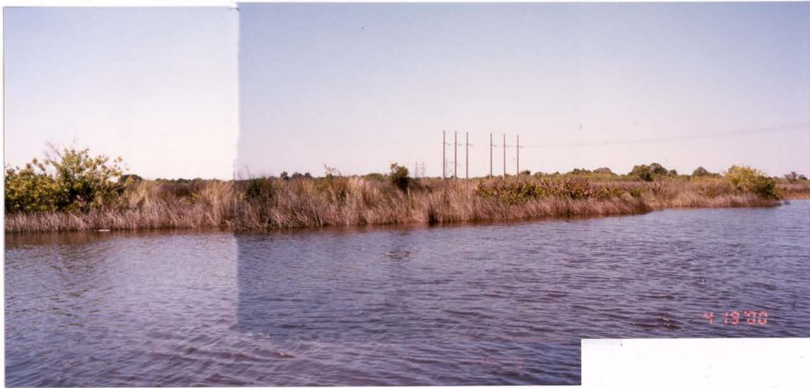
Photo 6, sand cordgrass ( Spartina bakeri ), 17.1 kilometers, west bank, first occurrence - 2000.