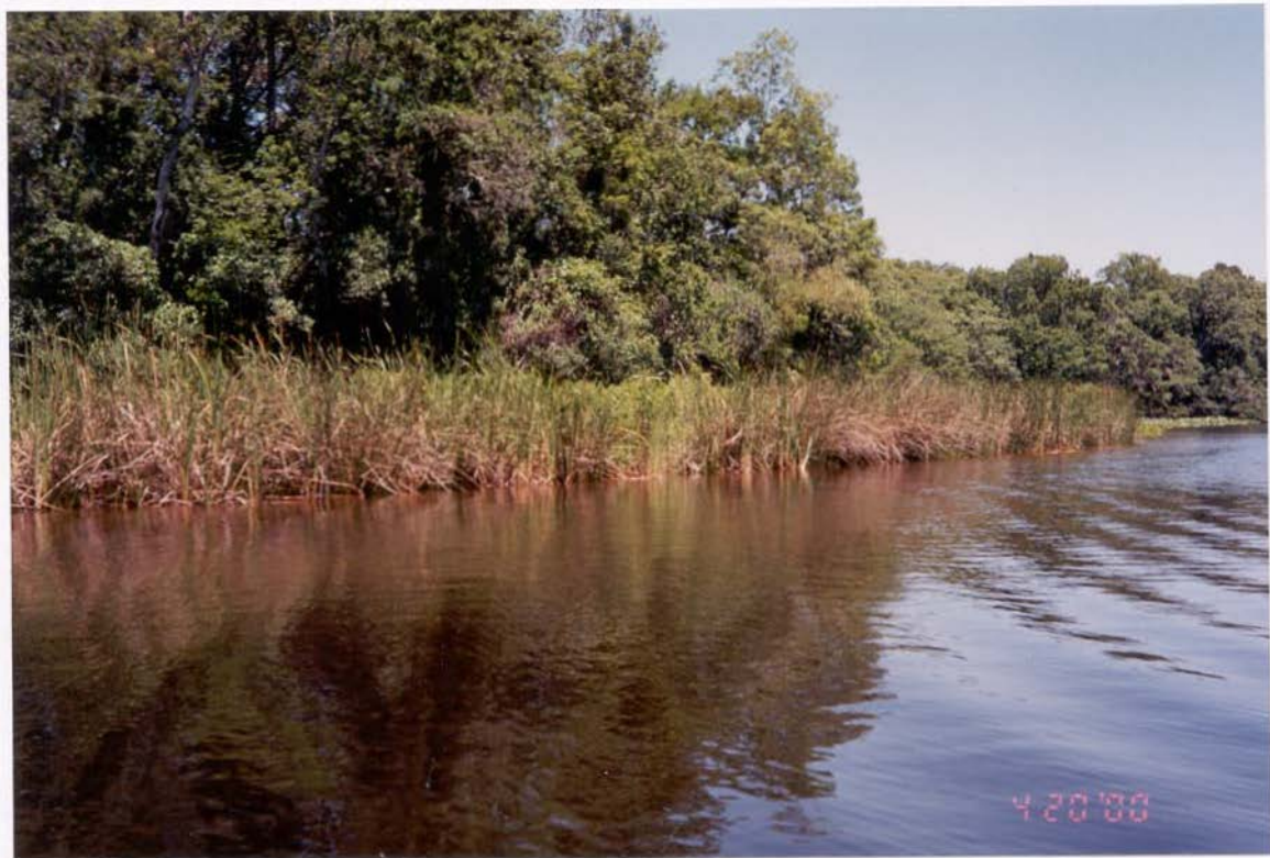
Photo 25, cattail/softstem bulrush ( Typha spp./Scirpus validus ), 29.3 kilometers, east bank, last occurrence - 2000.