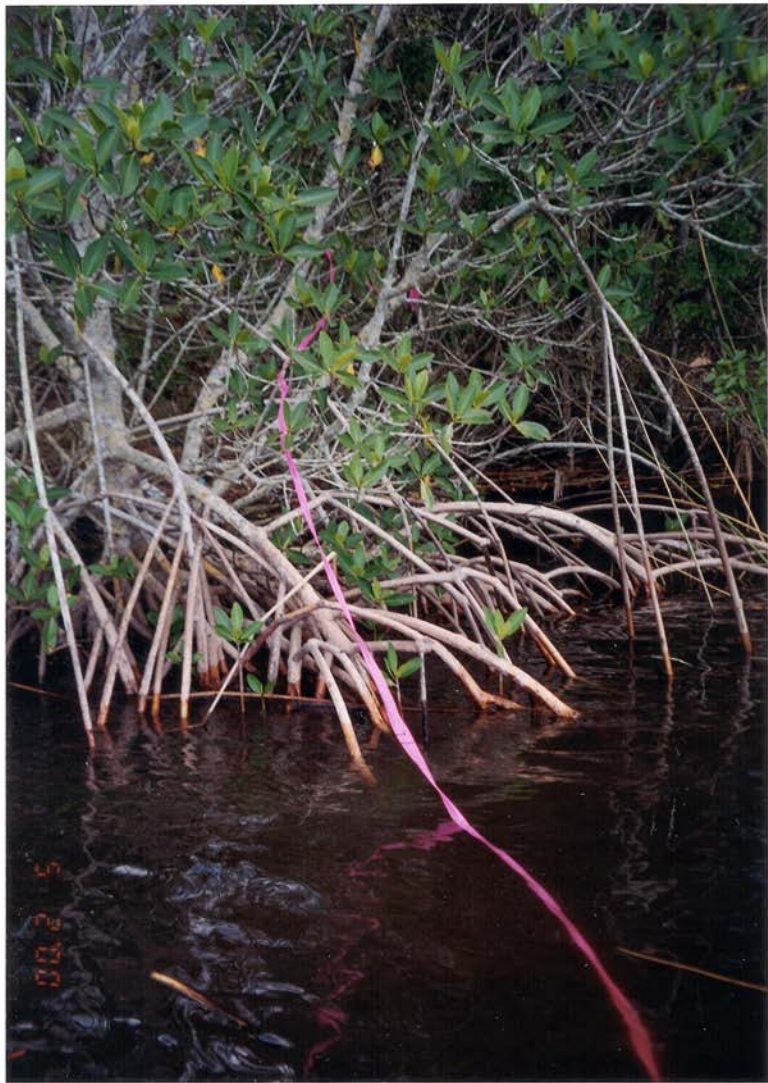
Photo 1, transition site, upstream belt transects midline - 2000.