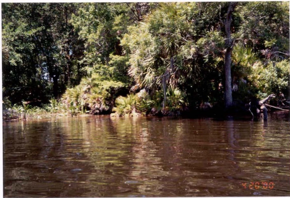
Photo 27, saw palmetto ( Serenoa repens ), 25.8 kilometers, west bank, last occurrence - 2000.