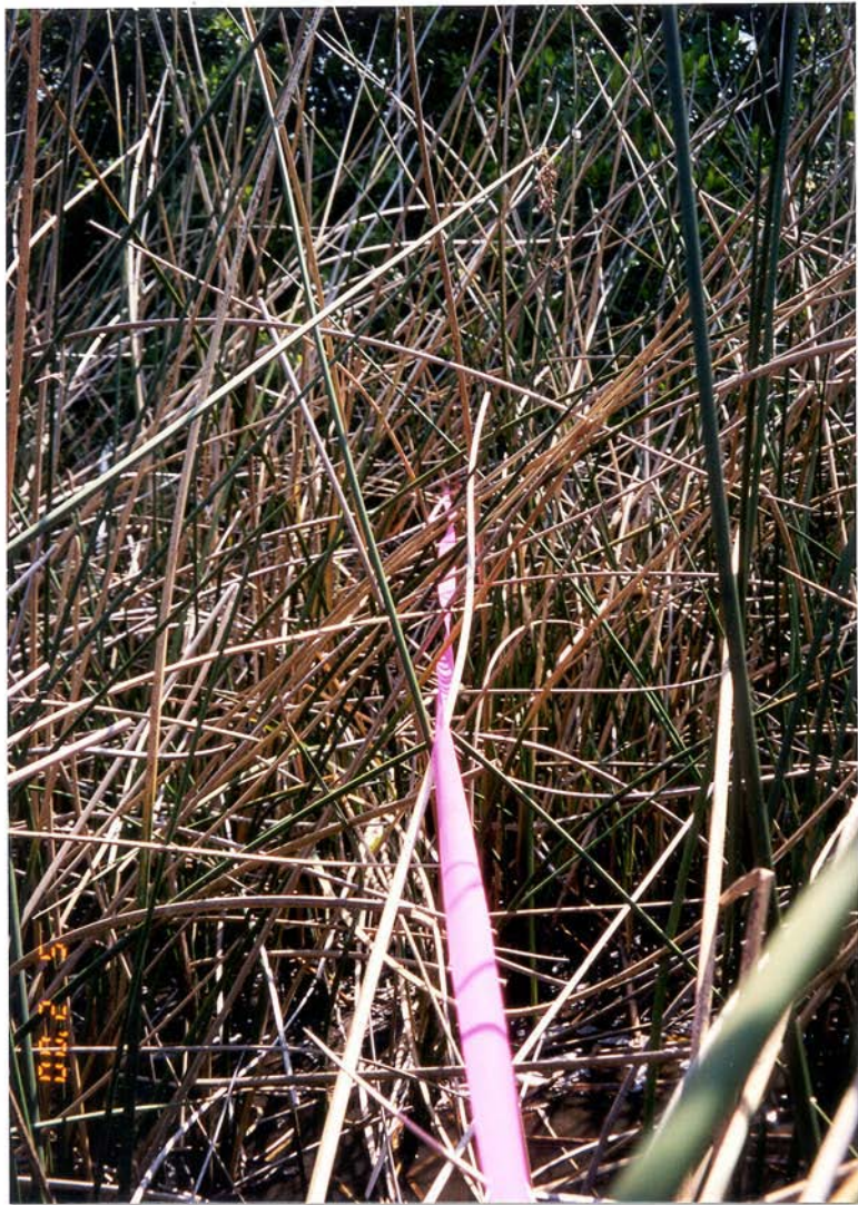
Photo 5, transition site II, line transect - 2000.