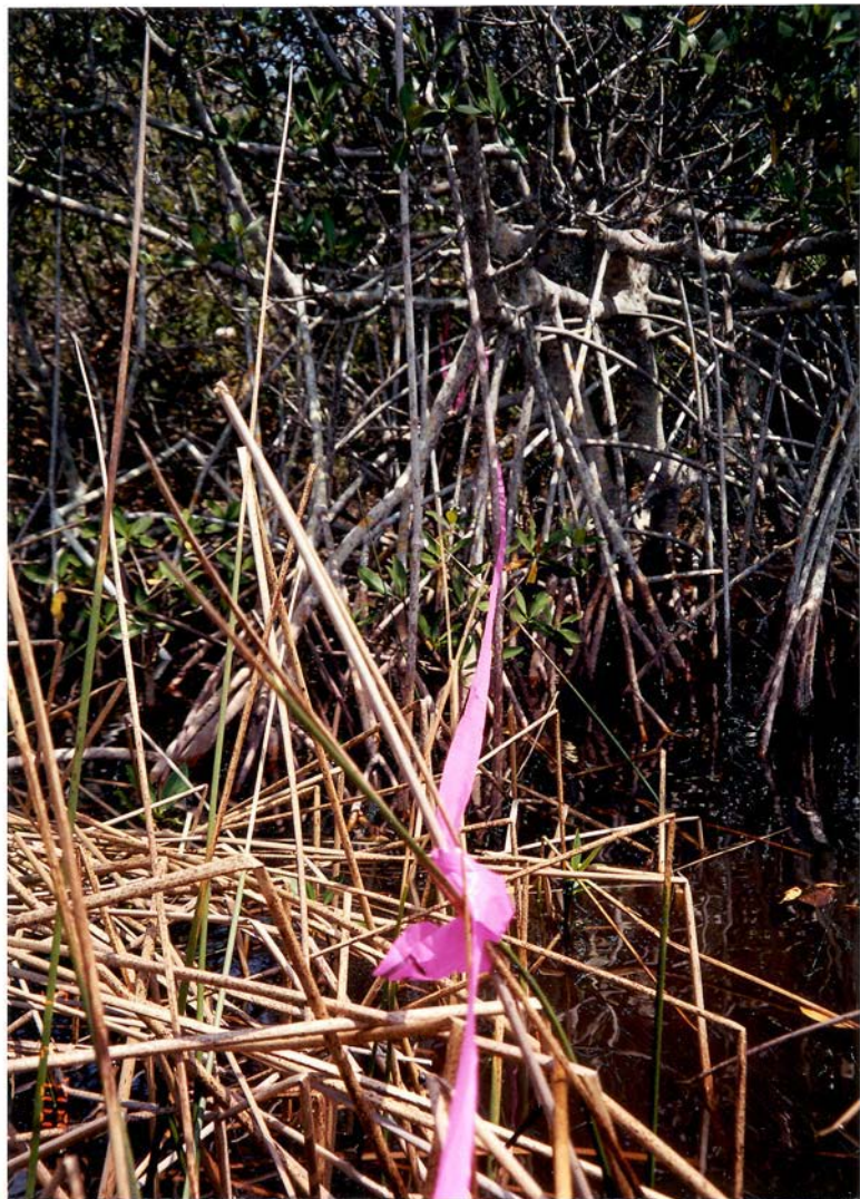
Photo 3, transition site I, downstream belt transects midline - 2000.