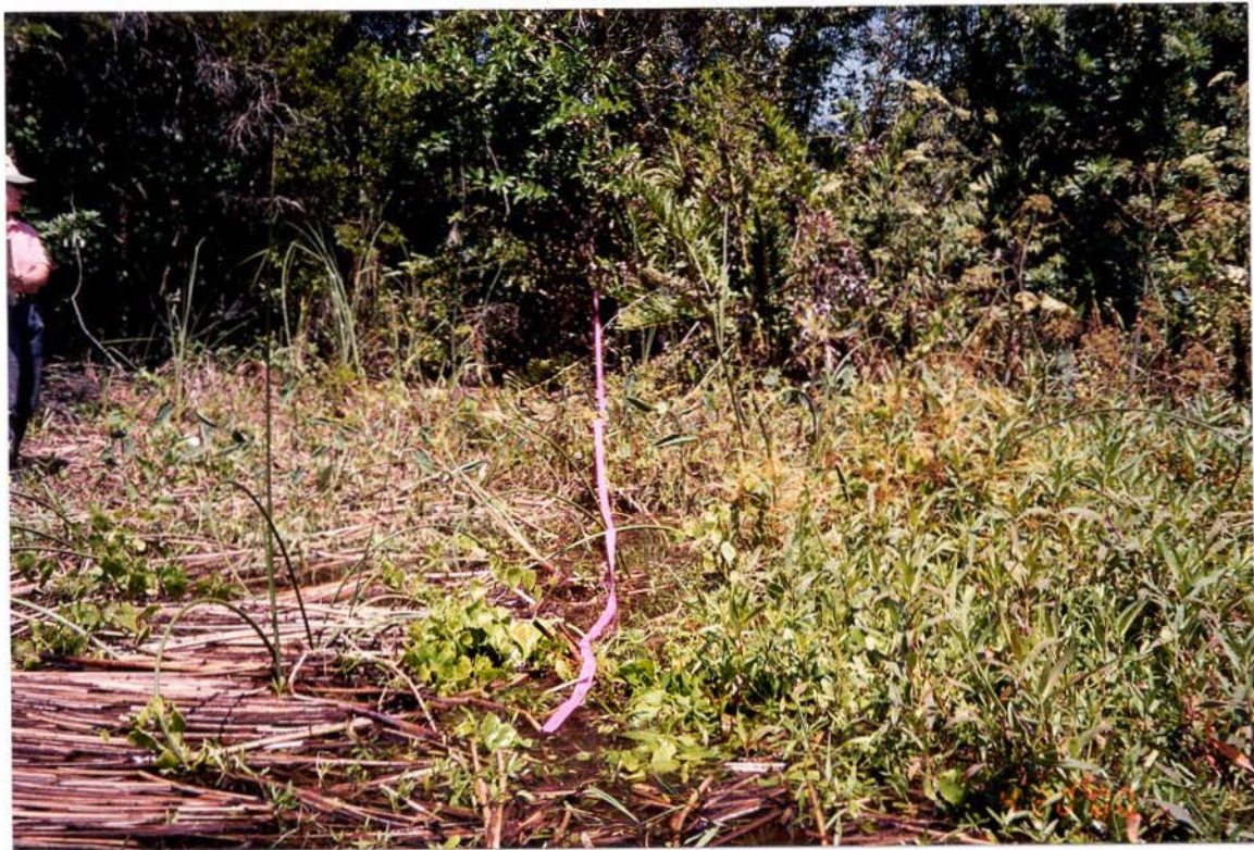
Photo 6, transition site II, downstream belt transects midline - 2000.