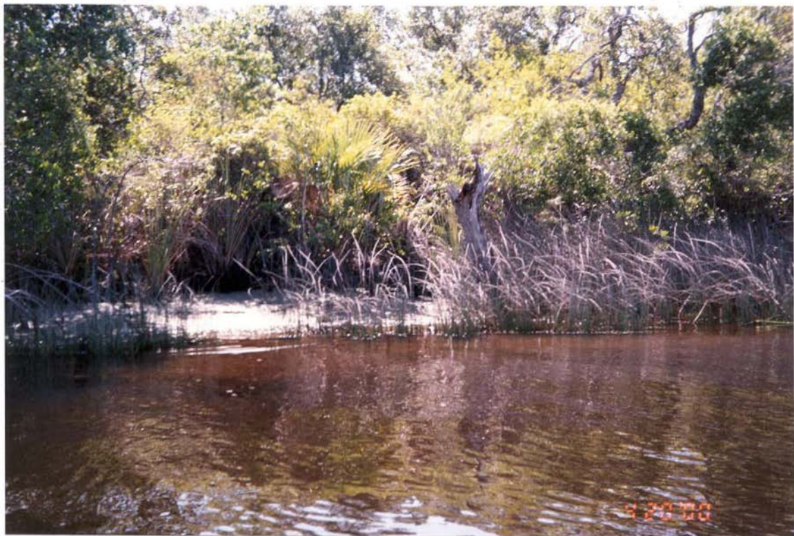
Photo 16, black rush ( Juncus roemarianus ), 21.3 kilometers, west bank, last occurrence - 2000.