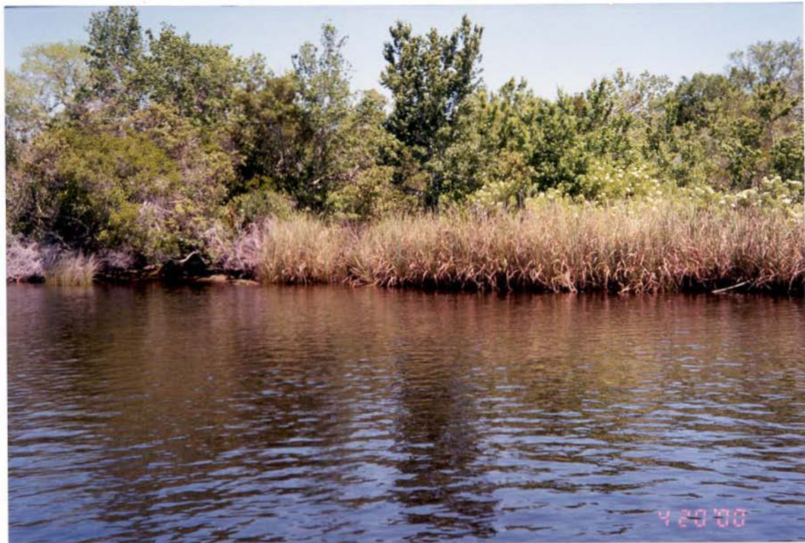
Photo 22, sawgrass/elderberry ( Cladium jamaicense/Sambucus canadensis ), 24.2 kilometers, east bank, last occurrence/first occurrence - 2000.