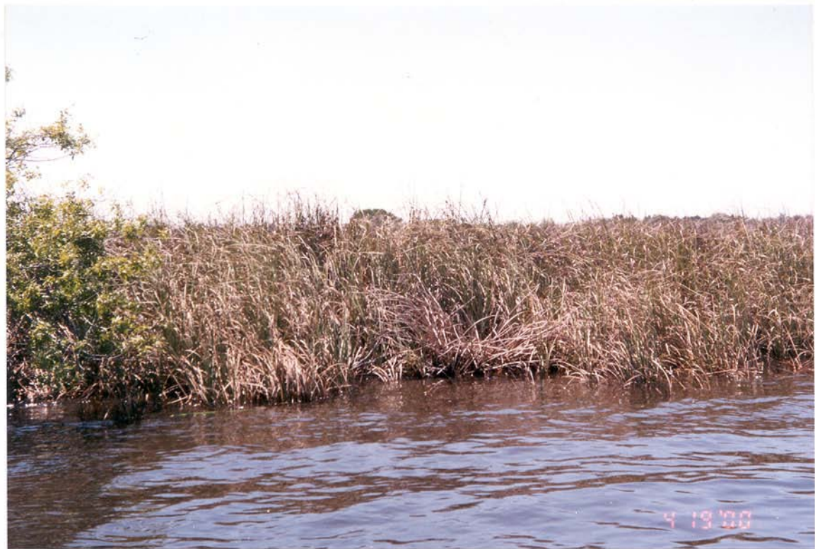
Photo 7, sawgrass ( Cladium jamaicense ), 17 kilometers, west bank, first occurrence - 2000.