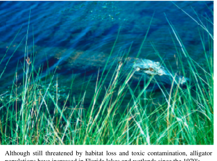
populations have increased in Florida lakes and wetlands since the 1970's.