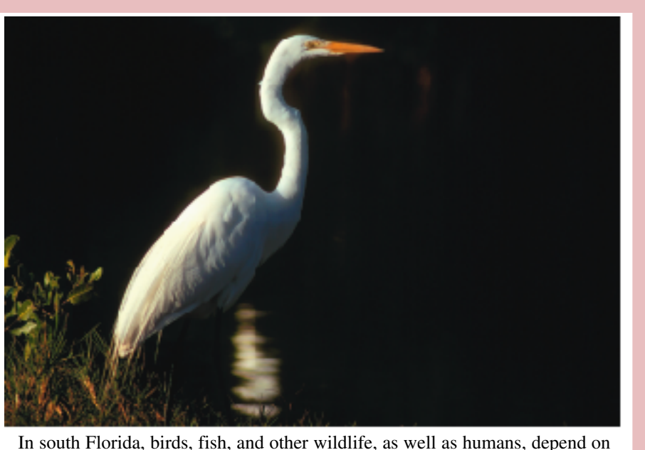
freshwater flows from the Kissimmee/Okeechobee Lowland to the north.