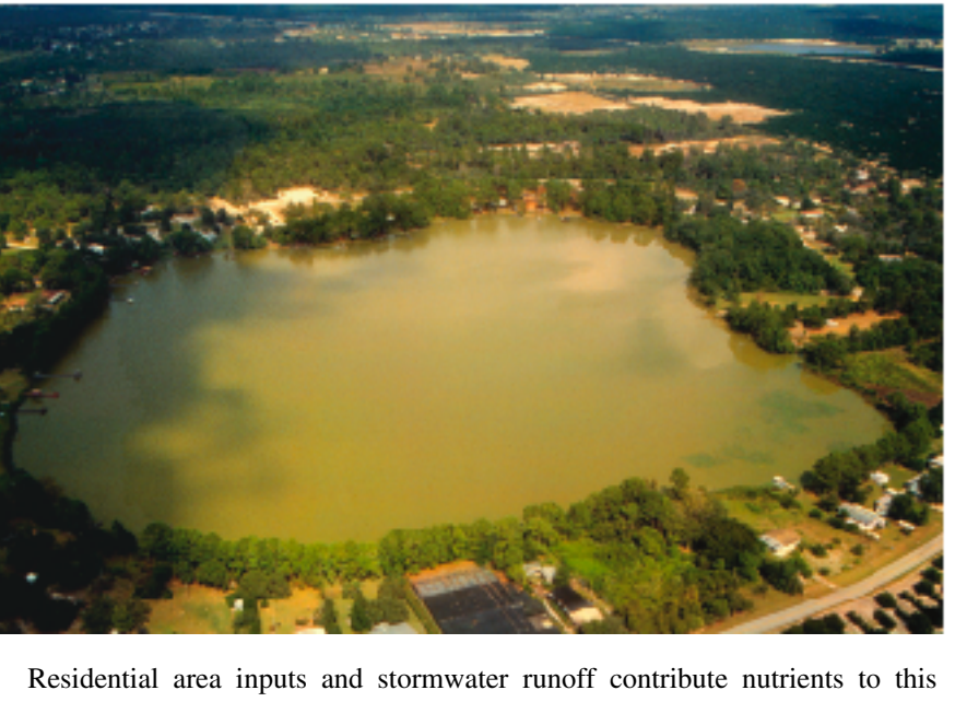
algae-dominated lake in an area of low-nutrient clearwater lakes (75-33).