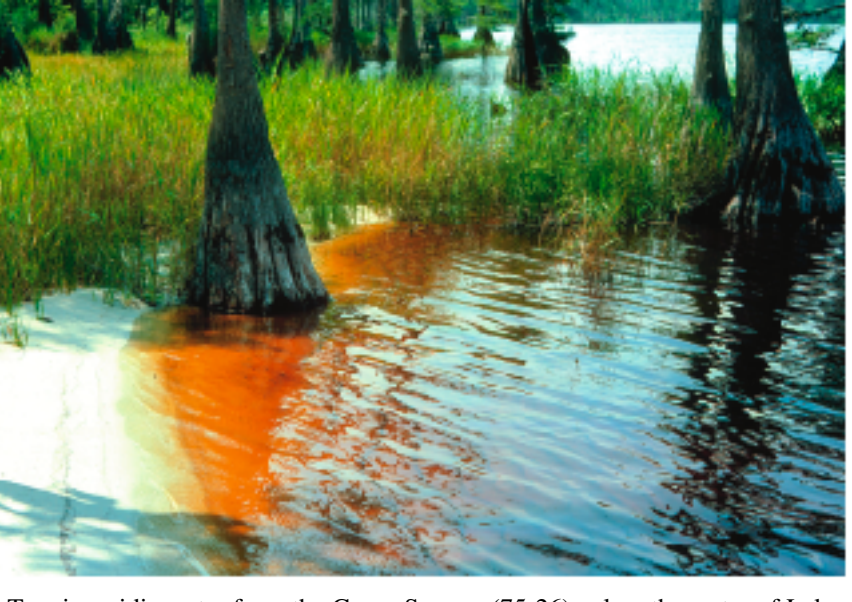
annic, acidic water from the Green Swamp (75-26) colors the water of Lake Louisa in the adjacent Clermont Upland region (75-19).