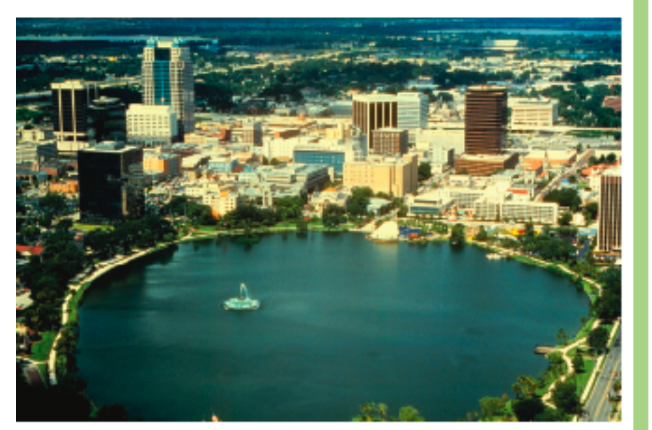
Urban and suburban modifications to lakes are common in the Orlando Ridge region (75-21).