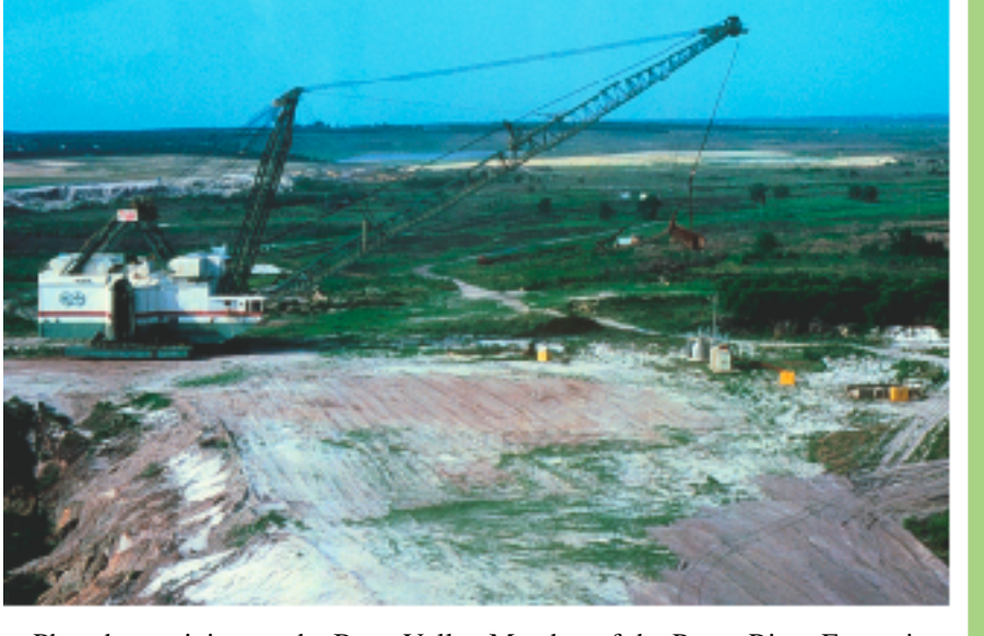
Phosphate mining on the Bone Valley Member of the Peace River Formation is widespread in region 75-30, and surface waters are nutrient-rich.